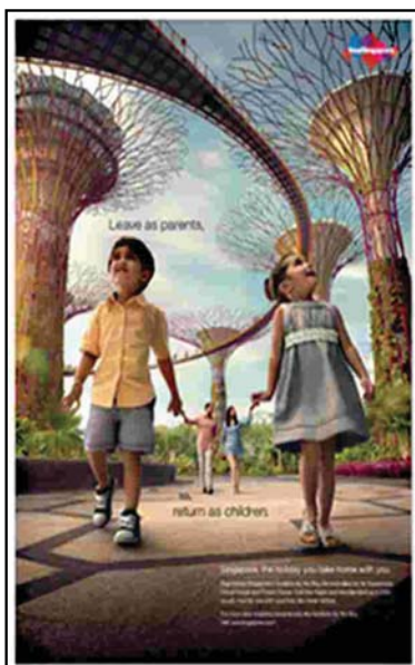
Creative from “The Holiday You Take Home with You”

To effectively influence the visitorship of the target audience, a visitor-centric approach in placing the consumer at the core of marketing initiatives and efforts will be adopted. By deepening an understanding of the target audience, and their needs which is a strong driver of travel behaviour, one is able to customise to meet needs, so that the visitor will see a greater value in coming to and spending time and resources in Singapore. This increases the appeal of and consideration for Singapore, which results in a more effective reach. Marketing resources are optimised when “the right message at the right time” is delivered to the target audience.