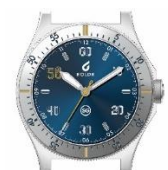
*Subject to final changes

To commemorate 50 years of the Merlion, BOLDR Supply Co. is releasing a special edition field watch. The watch embodies the Merlion's bold spirit, and is the first in the new BOLDR Safari collection, encased in 40mm stainless steel with 100m water resistance and a Japanese automatic movement. The BOLDR Safari Merlion 50 will be available for purchase on www.boldrsupply.co this October.