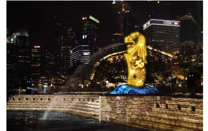
*Artist's impression

From 15 September till 29 September, the Merlion Statue located at the Merlion Park at One Fullerton will be lit up from 6pm daily to commemorate the Merlion's 50 th Anniversary. The statue will continue be lit for the Formula 1 Singapore Airlines Singapore Grand Prix 2022 from 30 Sept to 2 Oct.