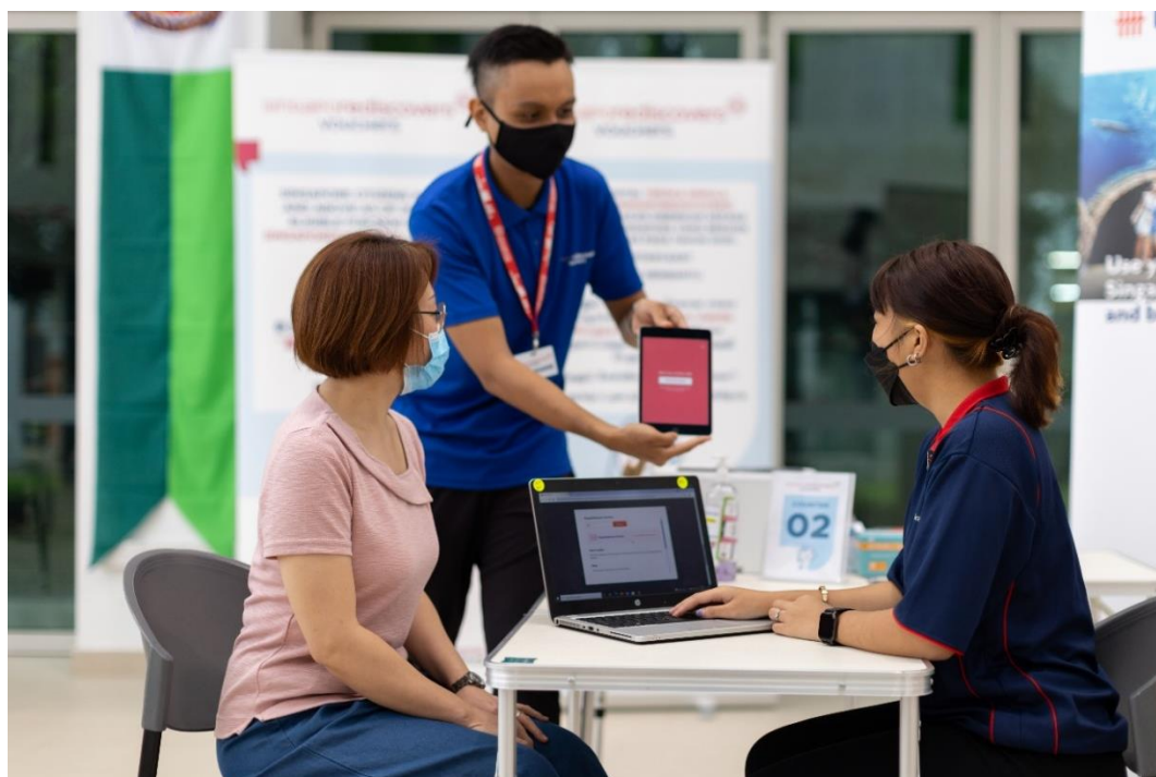
Once the Voucher code is generated, SRV booking partners will help citizens book their SRV-eligible experiences.