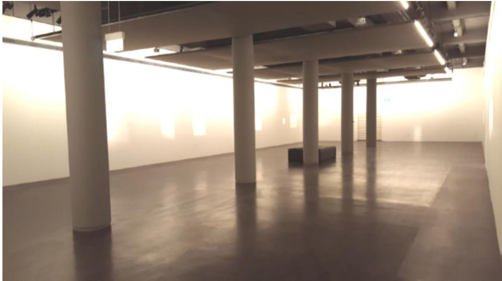
THE COLLECTION GALLERY